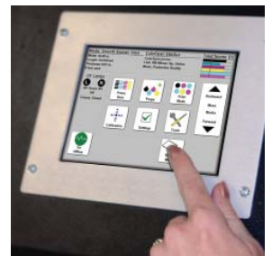
Easy and intuitive 17.7 cm color touchscreen front panel