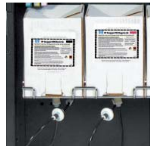
No-drip, quick connect/disconnect HP Designjet 788 inks